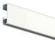
CLICK RAIL - WHITE RAL 9010