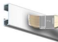
CLICK RAIL - WHITE/PRIMER RAL 9016