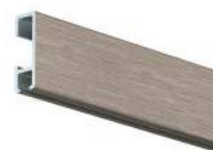
CLICK RAIL - ALU BRUSHED